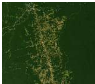
Amazon Rainforest in 2019